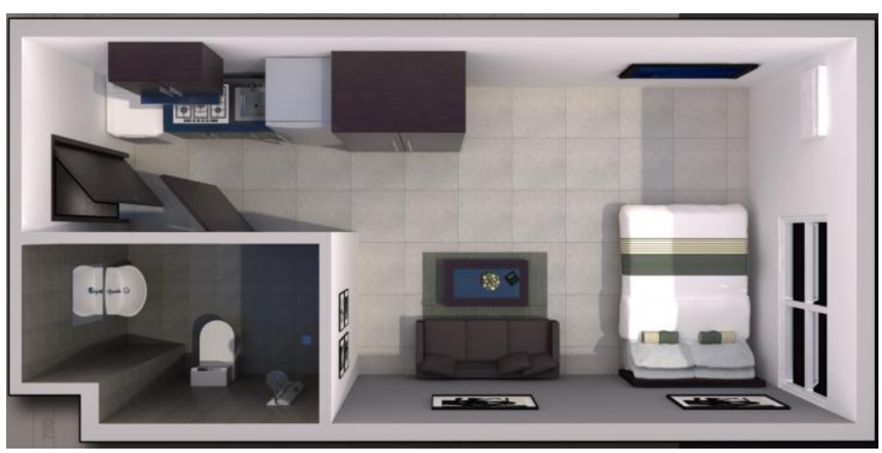
TYPE B1 UNIT (24.50 SQM.)